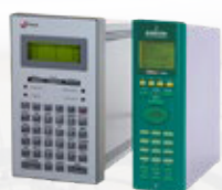
Integration with FloBoss/Omni